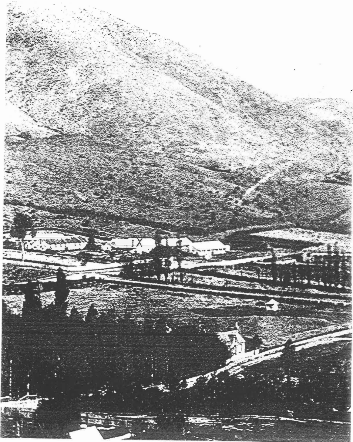
Fig. 5. Refugee Barracks (marked with an X)

Nelson Provincial Museum, Collection Bett. Early Hospital and Bishopdale. Ref. 1/2