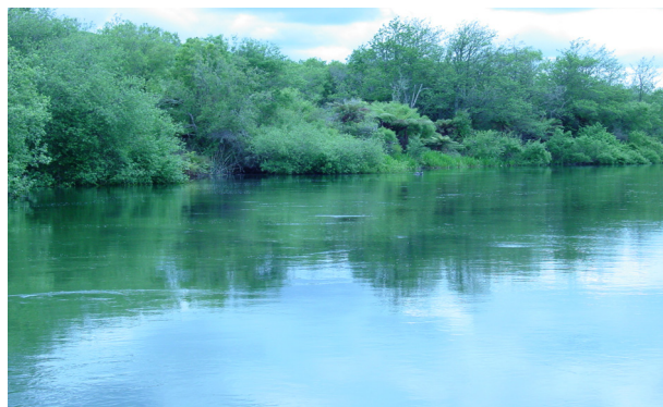
Figure 4. Willows dominating the true left bank of the lower Ohau Channel.