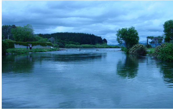
Figure 2. The weir between Lake Rotorua and the Ohau Channel where currents are relatively strong and fast.

The Ohau Channel begins where a weir has been constructed to control the outflow of Lake Rotorua (Figure 2) and the current is relatively strong and fast at this point. As distance from the weir increases the current slows as the channel widens and deepens (Figure 3) and an increase in the density of macrophyte beds occurs. At the downstream end of the Ohau Channel before it discharges into Lake Rotoiti the littoral zone is mainly dominated by willows (Figure 4).