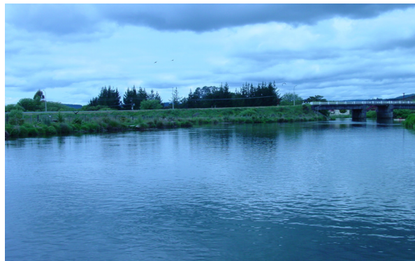
Figure 3. Halfway down the Ohau Channel at old oxbow on the true left bank.