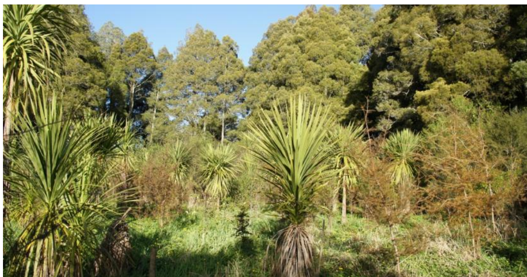
Figure 4. New Link, abundant pasture grass and widely-spaced natives, requires infill planting of colonising species.