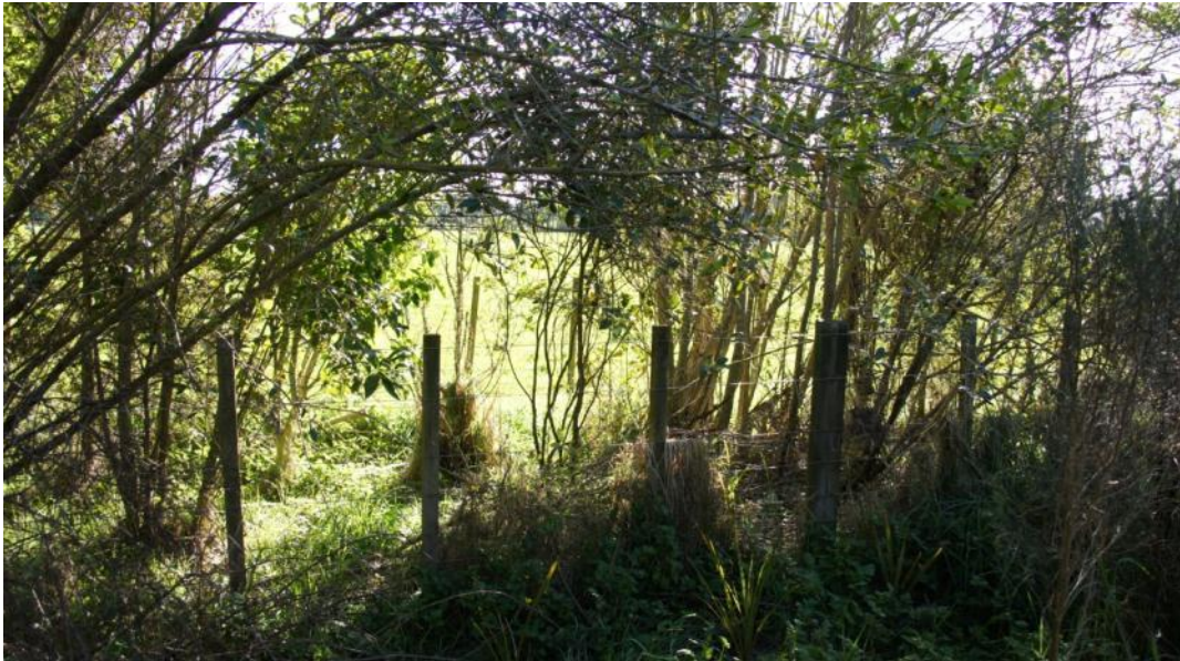
Figure 5. Border of New Link that needs enrichment planting because the existing plants are dying.