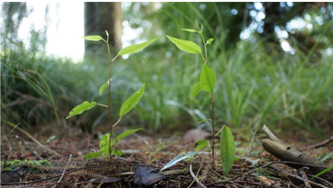
Figure 10. Kohia ( Passiflora tetrandra ) seedlings.