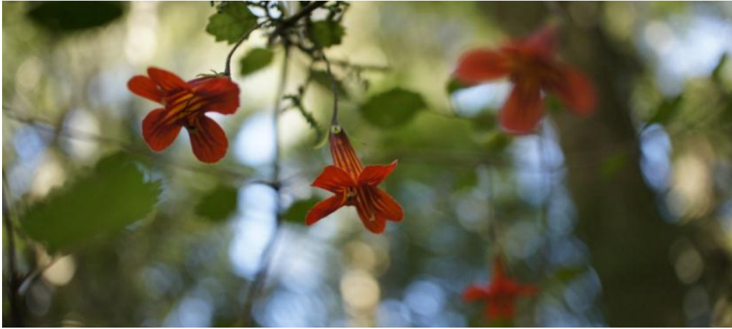
Figure 8. Kaikaiatua ( Rhabdothamnus solandri ) flowers in Northern Block.