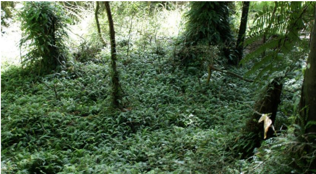
Figure 6. Abundant pānako ( Blechnum filiforme ).