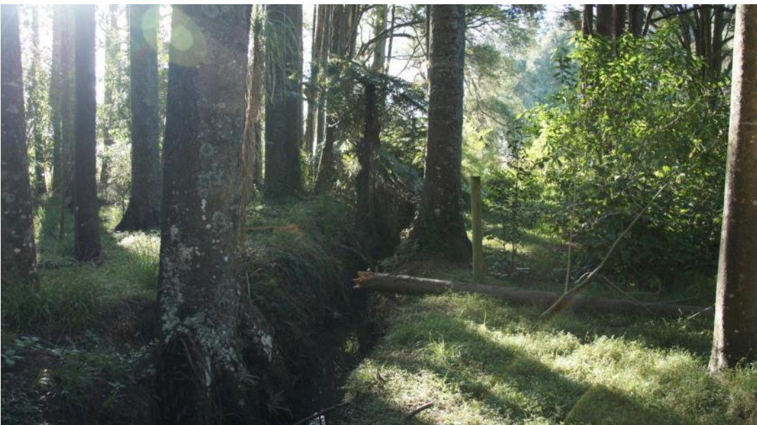
Figure 7. Drain in the Northern Block.