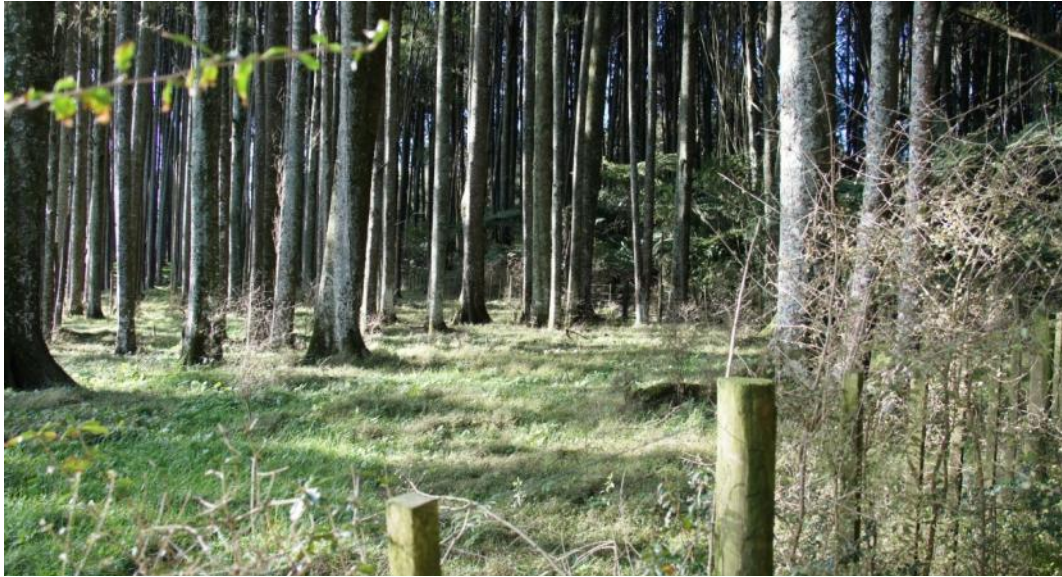
Figure 2. Kahikatea stand on farmland, western boundary.