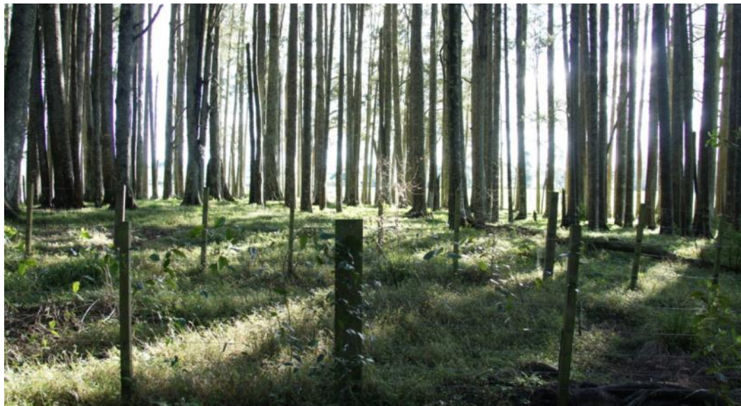
Figure 3. Double-fenced border between farmland kahikatea and western boundary, requires dense planting