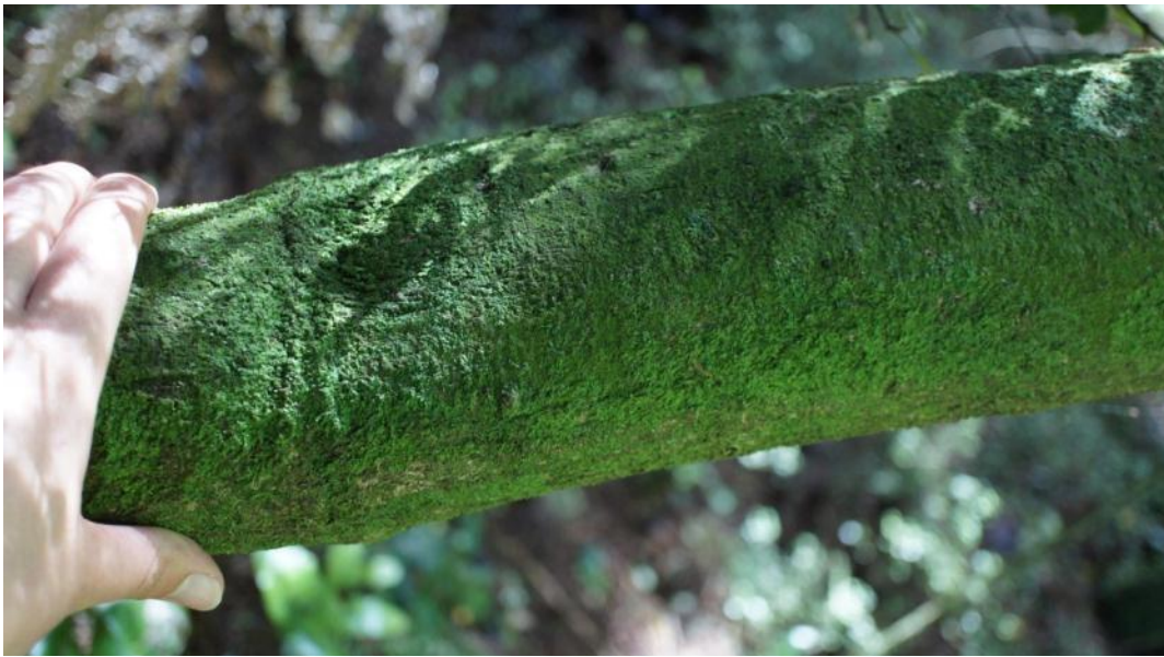
Figure 9. A large kohia ( Passiflora tetrandra ) vine.