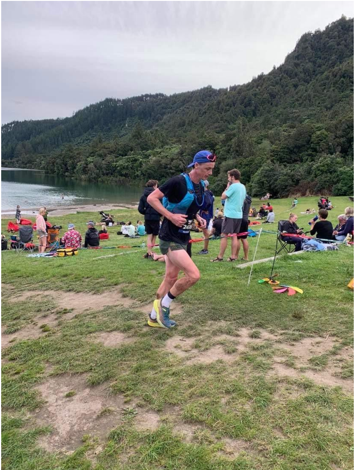
Running the 102-kilometre race at the 2023 Tarawera Ultra Marathon. Coming into the aid station at Tikitapu, still with 20 kilometres still to run (Helyar-Magill, 2023)