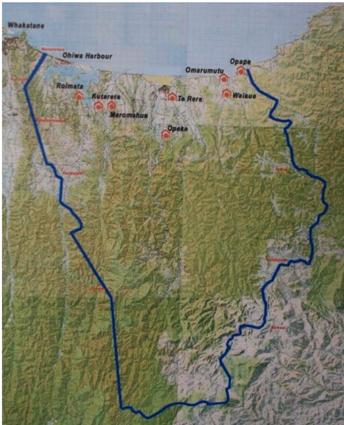
The rohe of Te Whakatōhea. (Tū Ake Whakatōhea Collective, 2016)