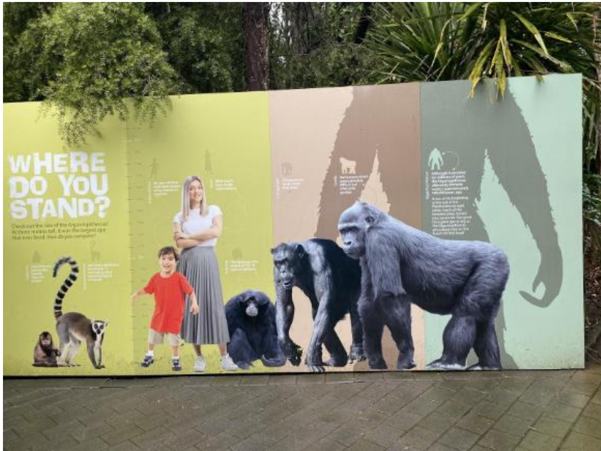
Figure 8. Photo depicting an interactive sign where visitors can compare their height to the height of other primate species.

The signage may have benefits beyond educating visitors. Hamish, the volunteer I spoke with, mentioned that the signage within the aviary is beneficial when collecting browse (food) for the giraffes. He has, in the past, used information on the signage, such as photos of the plants and notes on which are edible, to collect the correct plants to feed the giraffes. He further explained that signage is helpful when answering visitor questions in areas he isn't familiar with, such as the Parrot Court, saying "Sometimes you can stand in front of the sign and pretend like you're looking at the animal, but you're reading the facts." This speaks to a perceived need for staff and volunteers to be experts, even in