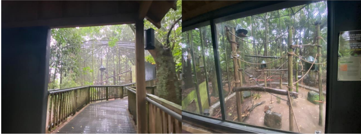
Figure 10. Two photos of the enclosures in the Rainforest section of Hamilton Zoo. L: a faraway photo showing the outside structure. R: A photo through the viewing window of the wood jungle gym in the capuchin monkey enclosure.