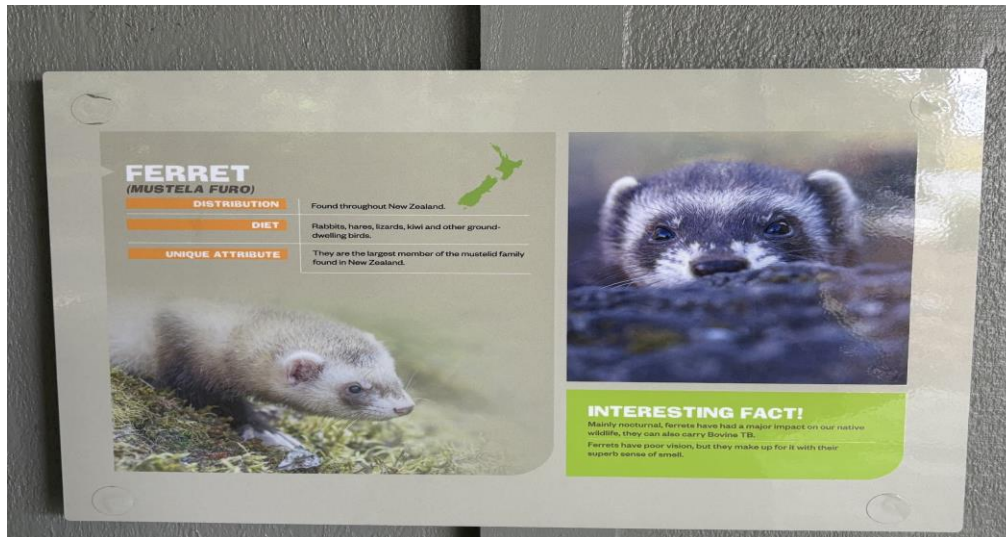
Figure 9. Photo of part of the informational sign for Ferrets, cropped to show only the interesting fact.

evolved within and to portray them exclusively as predators is to decontextualise the species and miss an educational opportunity.