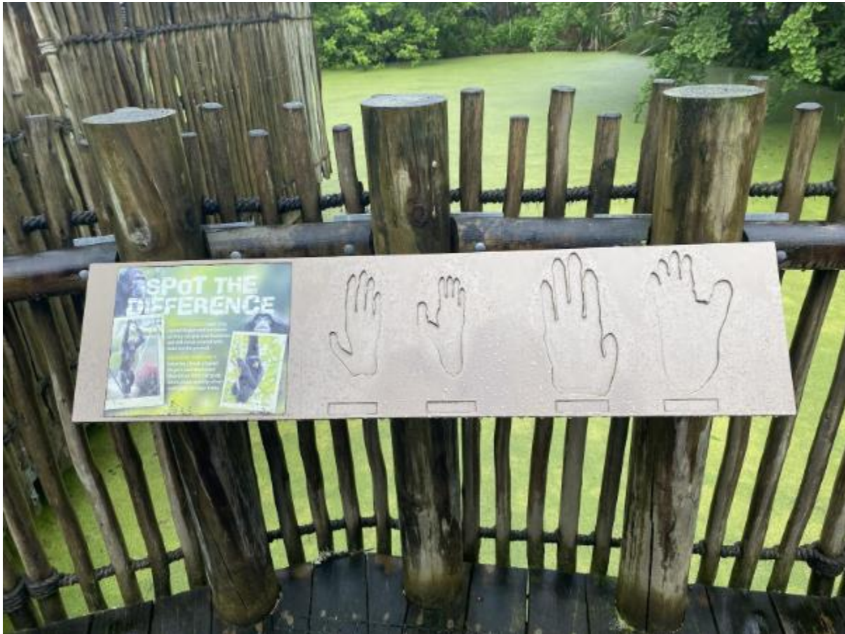
Figure 4. Picture of an interactive sign displaying the morphological differences between siamangs and chimpanzees.

While we were gathered on the observational pier, the siamangs began to sing. Each pair of siamangs has a specific song, which they use for pair-bonding (Geissmann and Orgeldiner 2000). Despite the cacophony not fifty meters away, it took a minute to locate the siamangs in the upper branches of the trees in their enclosure. “No way such a big noise came from those little guys,” one of the men said. The gibbons, once finished with their chorus, descended from the trees and ran across the enclosure to a wooden platform, where they perched. When they run, they extend their arms from their bodies, which