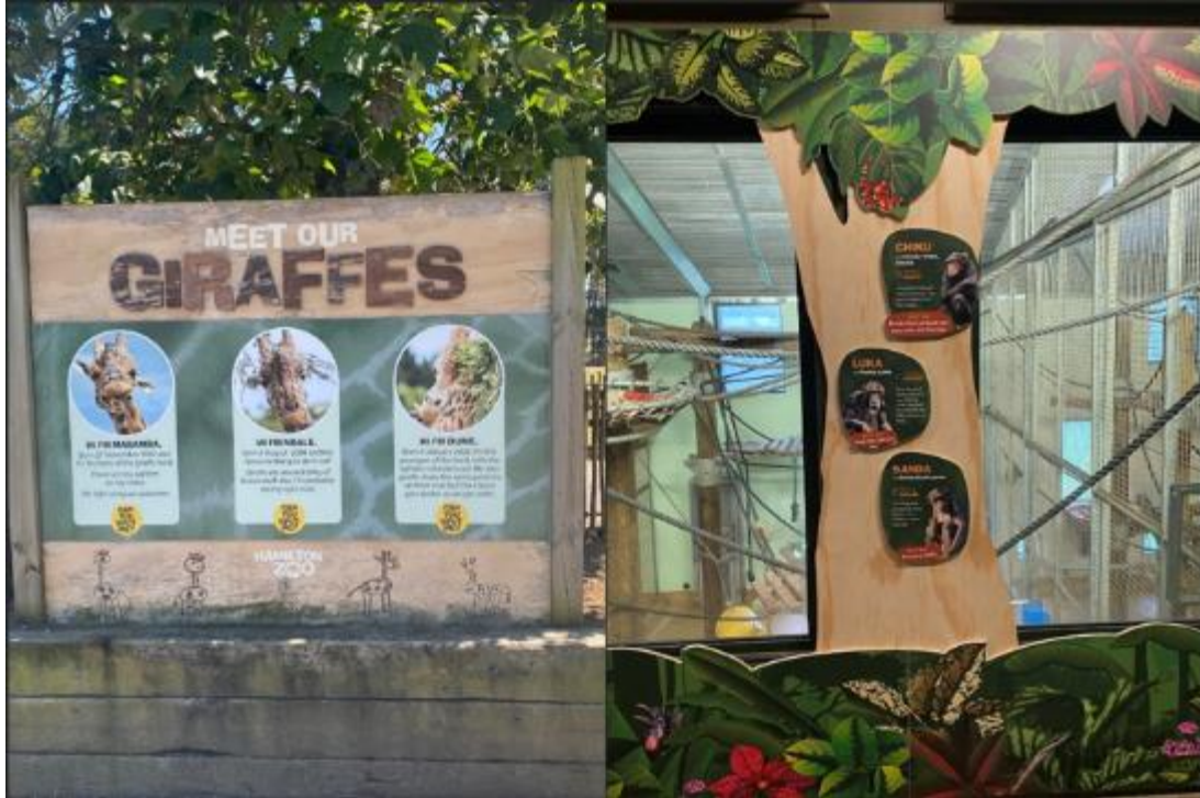
Figure 7. Images of signs introducing animals at Hamilton Zoo to visitors. L: Introducing giraffes. R: Introducing chimpanzees.