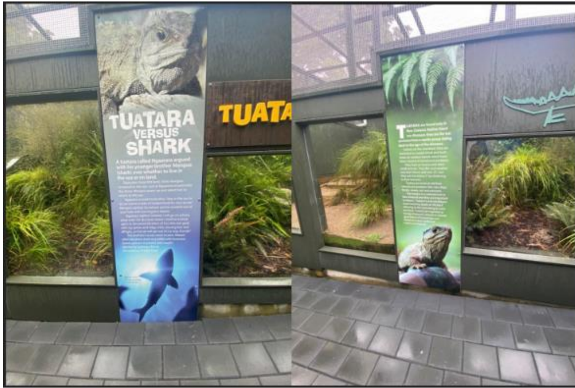
Figure 3. Photos of two signs at Hamilton Zoo's tuatara enclosure. L: Sign tells the story of the Māori myth of Ngaarara and Mangoo. R: Sign with ecological and scientific knowledge of the tuatara. Photos taken by the author.

At Hamilton Zoo, the Free Flight Aviary and Weka Walk display endemic birds, reptiles, amphibians, and eels. These areas represent knowledge of New Zealand gully systems, native birds and understandings of interactions between animal and person. For international tourists, this space is exotic. These birds are “the other”. The Aviary is also one area within Hamilton Zoo which does not have clearly demarcated “people” and “animal” spaces. Here, visitors follow a pathway that winds down through the aviary, surrounded by thick native shrubbery and brush. The path is lined with educational signage identifying the plants and birds found within the aviary. This information includes