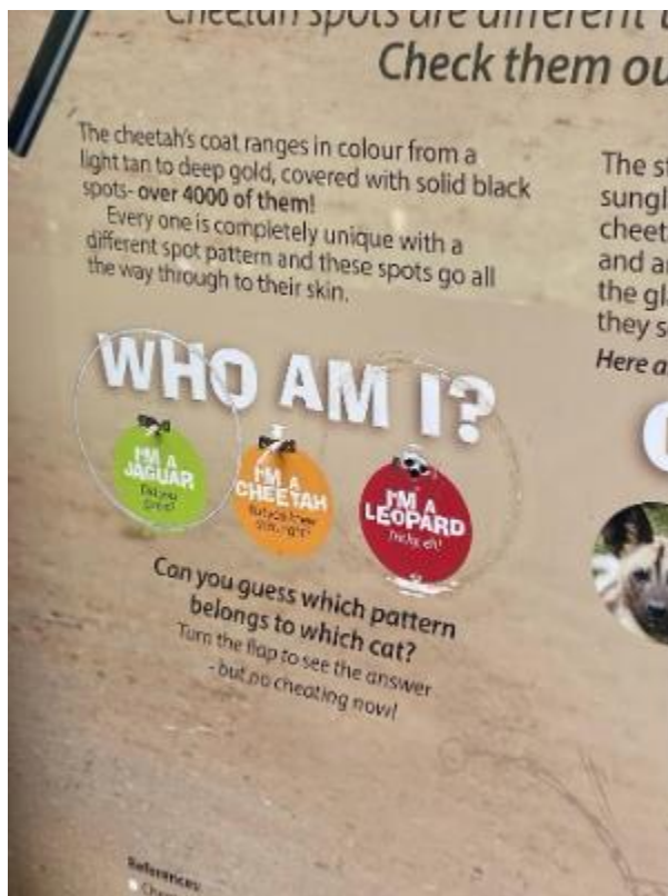
Figure 5. A photo of damaged signage which would ordinarily demonstrate the different patterns between jaguars, cheetahs and leopards.

Other similar times when this misidentification occurs is in instances of pattern recognition, where cheetah and leopard print are used interchangeably, which the signage at Hamilton Zoo has attempted to rectify by including pattern differentiation in their cheetah signage (Figure 5). Similarly, zoo visitors would refer to wanting to see “the lions”, in direct reference to the tigers. However, I do not believe this was a true case of visitors not caring about the difference but rather being confused about which zoo in New Zealand has which animal, as visitors would rapidly correct themselves.