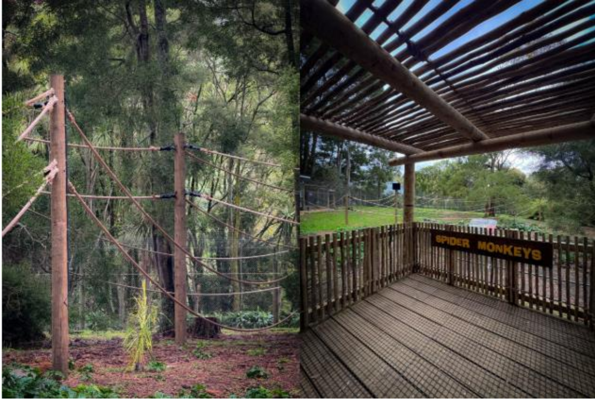
Figure 11. Two photos of the rope additions to the spider monkey enclosure at Hamilton Zoo.