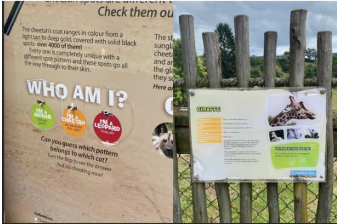
Figure 6. Photos of damaged signage. L: Flaps previously secured by rope have been removed. R: Paper sign damaged by weather is crumpled and stained between plastic sheeting.

There is interactive signage around the Chimpanzee House, with profiles of the chimps that can be swapped out as the troop changes (Figure 7). A similar sign exists at the bottom of the path by the Savannah, introducing the giraffes at Hamilton Zoo (Figure 7). Alongside which is a measurement tool at the bottom of the Savannah, guests can compare their height to the height of a giraffe. This sign was so popular I was unable to take a photo without other visitors in view, but another, similar height comparison sign is at one viewing space by the chimpanzees, where visitors can compare their height to many primate species (Figure 8). While the chimpanzees and the giraffes have signage which introduces the animals by name to visitors, no other species have this same information, despite all being named. This type of signage is not at every viewing point