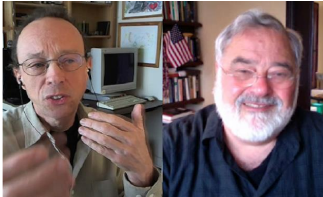
Mark Johnson & George Lakoff