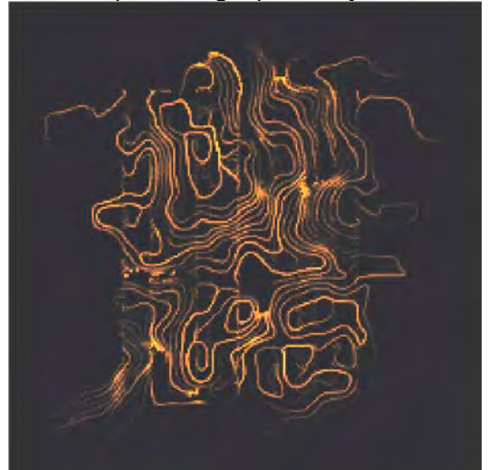
1 CE final output

We begin with a credit card number and from that we generate a linear barcode (as seen in figure 2) which then grows across a flow field. This flow field is created with a noise seed generated from an md5 hash of one of the 10,000 most popular passwords leaked online. This noise seed is generated by summing all the values of the ASCII characters. We realise that this can result in many values in the same relative area, but this is just a first attempt at a larger possibility.