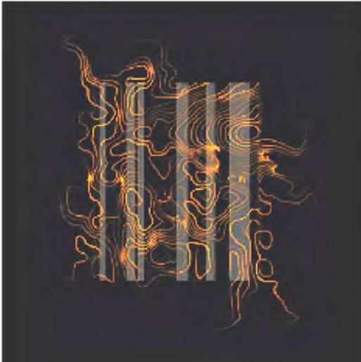
2 CE final output with barcode visible

We believe that in spite of the output being beautiful, but there is ample room for improvement as this is only a beginning.