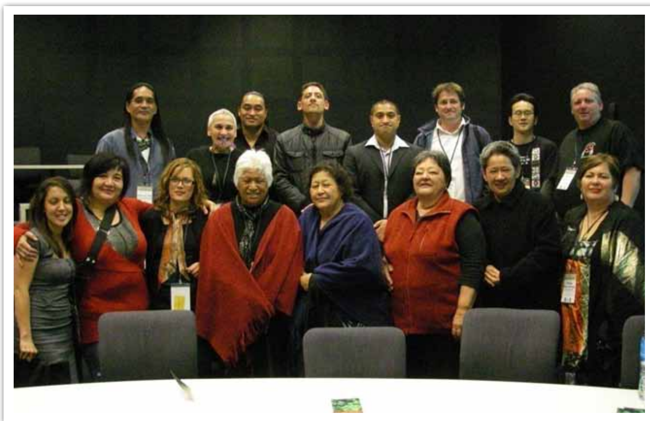
Research members from MPRU and CMPDR at Nga Pae o te Maramatanga 4th International Indigenous Conference: Matauranga Taketake: Traditional Knowledge, Auckland University (6-9 June 2010)