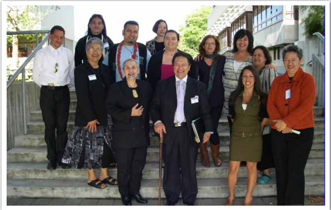
Members of the Tangi Research Programme at the Death Studies in Aotearoa/New Zealand Symposium (11 November, Waikato University)