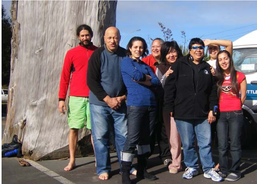
MPRU and Massey University students (Annual Conference of the NZ Psychological Society, Hamilton).