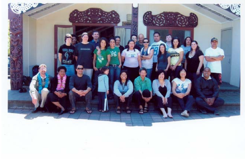
MPRU staff, students and friends, Te Kohinga Marama Marae, Hamilton (National Maori & Pacific Psychologies Symposium)