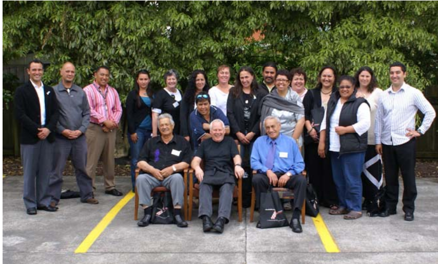
Staff and students from Massey University (National Maori & Pacific Psychologies Symposium)