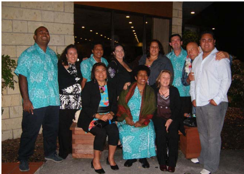
Students from the University of South Pacific (Fiji) and MPRU (National Maori & Pacific Psychologies Symposium dinner, Kingsgate Hotel, Hamilton)