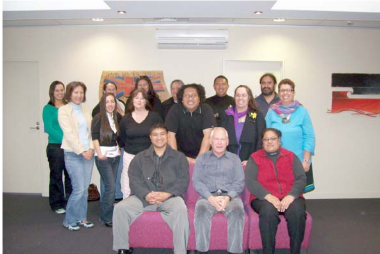
Staff and students of MPRU and Massey University (Maori in Psychology symposia, Massey University, Albany Campus)