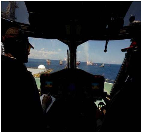
Before the image was altered