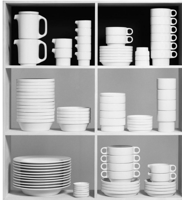
Figure 6 Hans (Nick) Roericht. TC100 tableware. 1959 thesis project at the HfG Ulm.