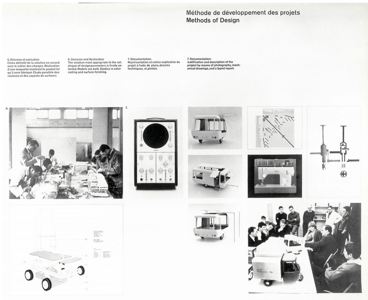
Figure 1 Exhibition panels from the Ulm School exhibit at Expo 1967 in Montreal, Canada.

In the 1967 Montreal exhibition, the school presented a panel with several vehicles and products related to transportation (Figure 1). To expand those cases, in several courses the students worked on vehicles (truck and bus bodies, utilitarian vehicles, affordable cars), road and traffic framework (lights, signals, gas stations), bus-related services (bus stops, shelters, ticket sales), among others (Figures 2, 3, and 4). Based on the facts mentioned above, and considering the HfG's concern for transport systems and logistics, a few of those projects were selected to be exposed in this article.