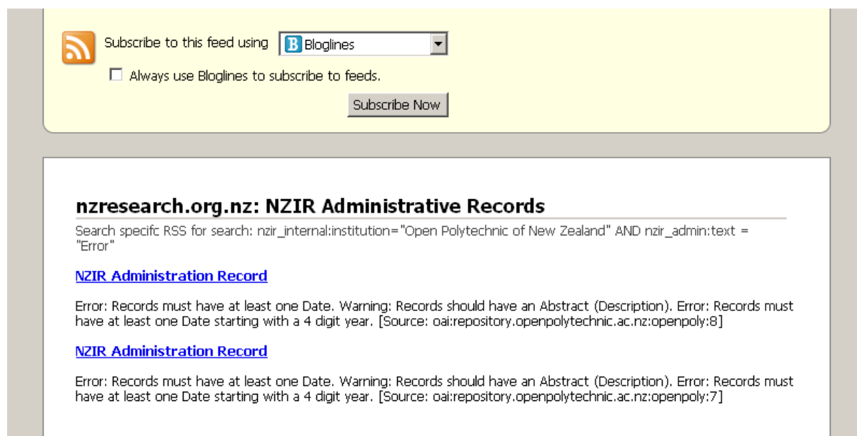
Figure 1. An RSS Feed for metadata errors from the Open Polytechnic of New Zealand research repository displayed in the Firefox web browser (July 2008)

Another use of NZIR Administrative metadata is to calculate statistics about the metadata quality for each institution, and for the combined collection of records in KRIS—what we call the "state of the nation's metadata." We can use these statistics to compare the performance of different institutions, and can track changes in metadata quality over time. Reports are calculated daily, and users can access the reports at any time. Figure 2 shows a recent KRIS metadata quality report. The final line shows the overall performance. The 5,413 records in the repository contain 35 errors and 337 warnings, which are distributed among 342 different "bad" records. The "state of the nation's metadata" at this point was 93.68% compliant.