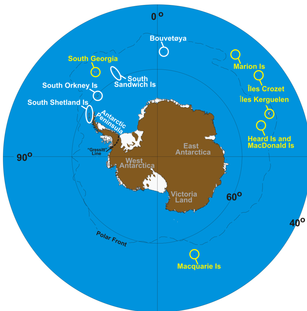
Figure 1. Map showing the different Antarctic zones and locations referred to in the text. Each zone is indicated by colour: yellow corresponds to sub-Antarctica, white to maritime Antarctica, and grey to continental Antarctica. In addition, the ‘Gressitt Line’ is shown at the base of the Antarctic Peninsula (see text).

Throughout each of these zones, springtail diversity is relatively well known, and up to 25 species of Collembola have been described [52]. However, just seven species have been the focus of phylogeographic studies (largely due to logistical and financial constraints). This includes three continental Antarctic species, one continental/maritime Antarctic species, and three species from the maritime Antarctic.