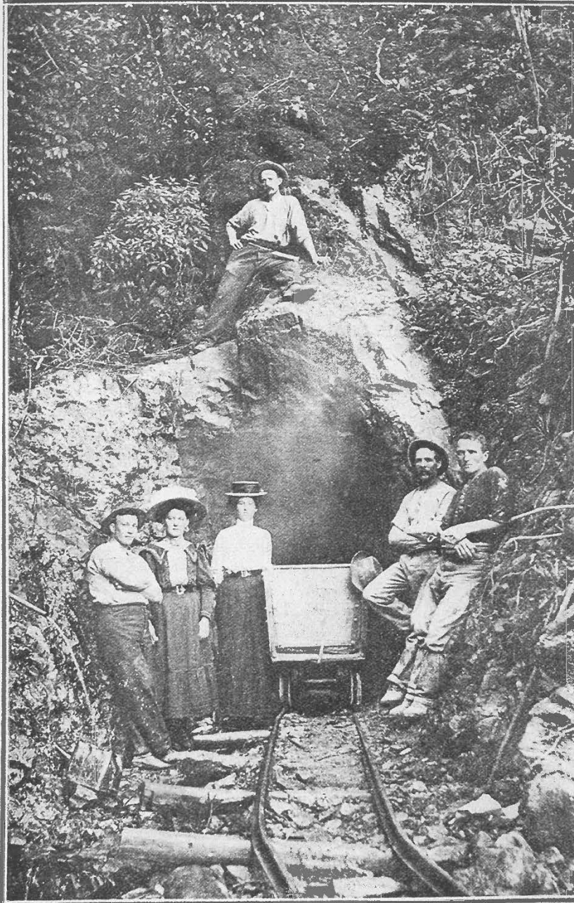
THE MINING REVIVAL IN THE AUCKLAND PROVINCE. MURPHY'S CLAIM, TE AROHA, WHERE PROMISING INDICATIONS ARE BEING MET WITH. Some very rich specimens have recently been won from this shaft, and have been exhibited in the township at Te Aroha. Tibbutt and Co., Photo.

Figure 2: 'The Mining Revival in the Auckland Province: Murphy's Claim, Te Aroha, where promising indications are being met with', Auckland Weekly News , 8 July 1909, Supplement, p. 6, Sir George Grey Special Collections, Auckland Libraries; used with permission.